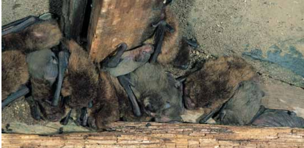
Pipistrelle nursery colony in a house roof. The young bats are grey.