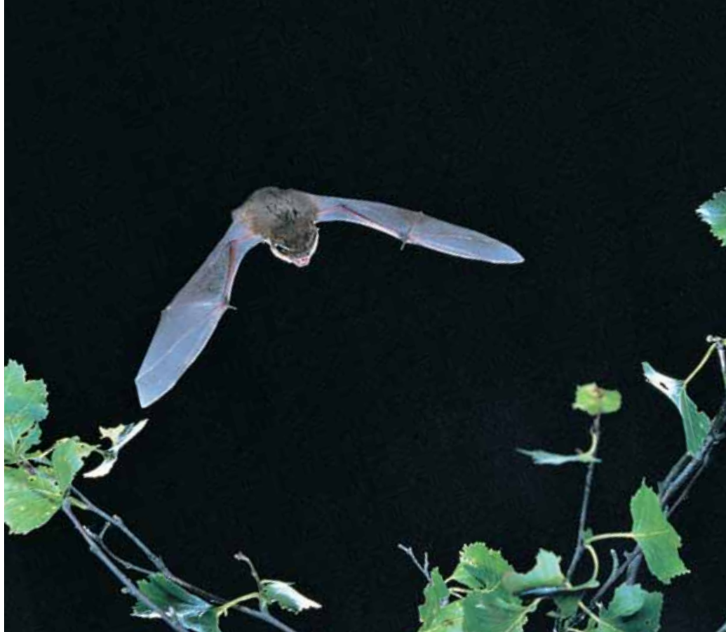
Pipistrelle bat in flight.