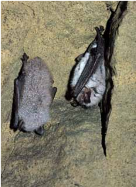
Whiskered bat and Natterer's bat in hibernation. The bats are so cold that condensation forms on their fur.

warmer climates, but our bats have perfected a different technique – they hibernate. During the autumn, bats put on weight and then, as the weather gets colder, they let their body temperature drop to close to that of their surroundings. They also slow their heart rate to only a few beats per minute. This helps their fat reserves last as long as possible. In this state, bats can't wake up quickly to move out of danger, so they choose undisturbed places to hibernate in.