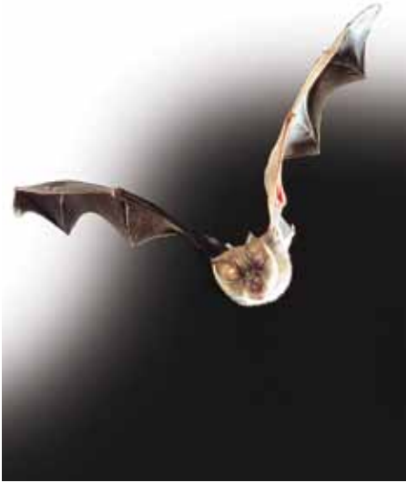
Greater horseshoe bat in flight.

leaving roosts and access points unaltered so the bats can return in following years. If you want to carry out works in a way or at a time that will affect bats or their roosts you will need a licence from Natural England (see Contacts, page 22).